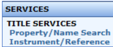
Figure 2: DTS2 Services Panel