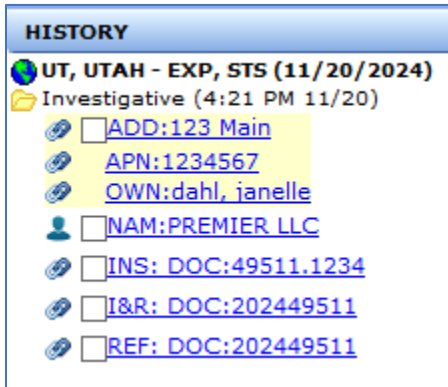
Figure 5: History Panel

Although Property and Name parameters may be searched simultaneously, they represent distinct and separate searches. The History Panel will display the Title chain icon for both Property and Instrument/Reference type searches and display the name icon for Name searches. Additionally, the History Panel will display the parameter searched rather than displaying the Plant property that search resolved to.